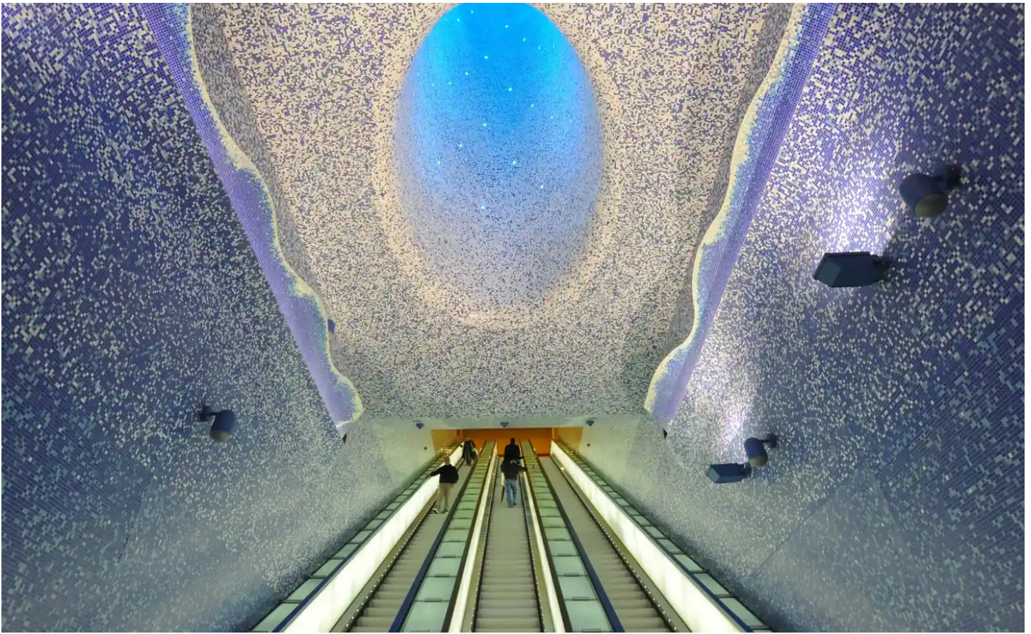
• The Olaias metro station, Lisbon, Portugal