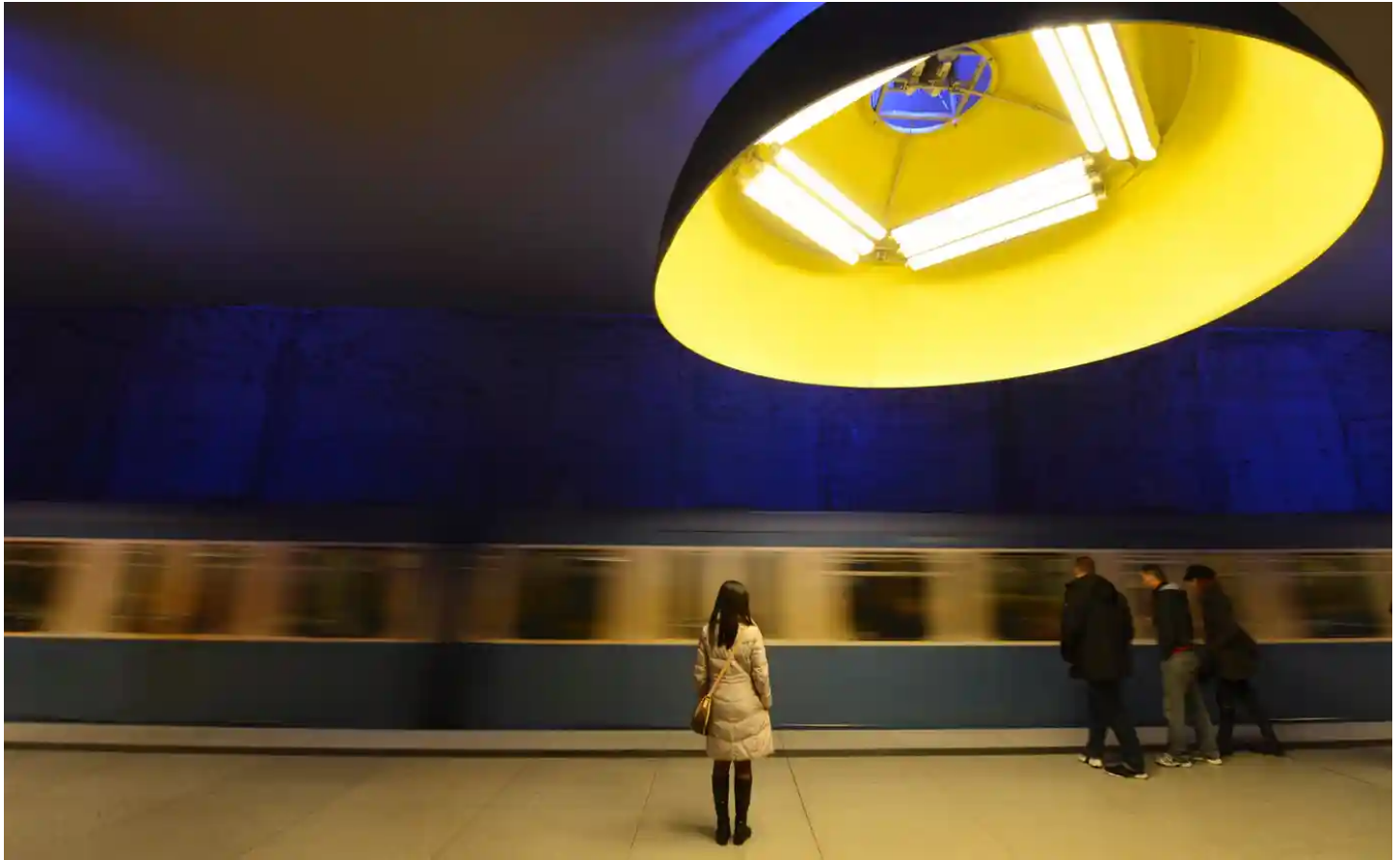
• The metro station at the Plac Wilsona in Warsaw, Poland