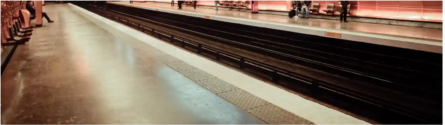
• A corridor in the Golden gate metro station in Kiev, Ukraine