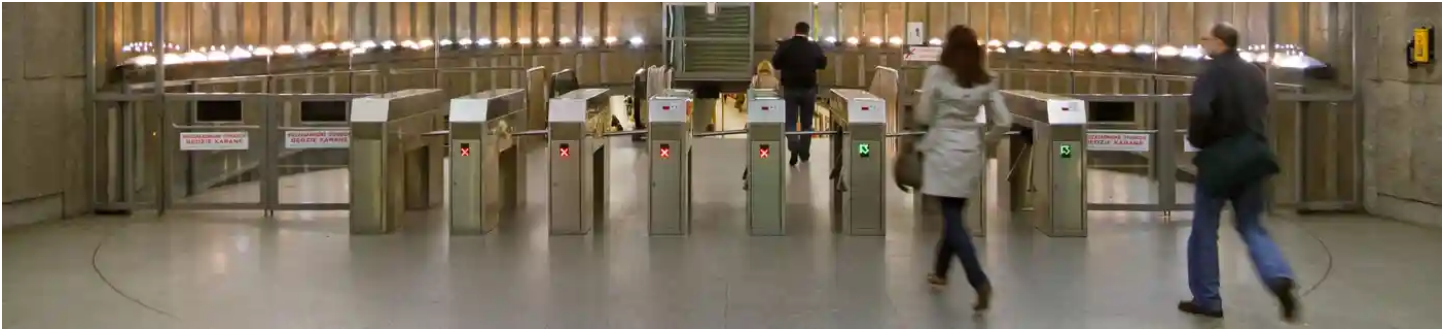
• Museum station in Toronto Canada, opened in 1963 and named after the nearby Royal Ontario museum